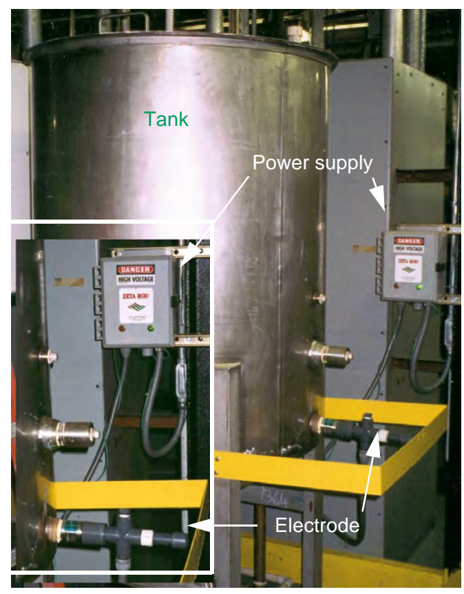
Figure 2: Installation of the Zeta Rod electrode and power supply at the shear spray lubricant mixing tank.

The Zeta Rod is a ceramic-sheathed electrode that is installed in the mixing tank (see Figures 1 & 2). A powerful electrostatic field is generated within the tank